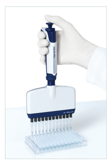
12-channel Manual Pipette