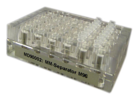
Fig. 4: MM-Separator PCR strip adapter. Dimensions: 12.8 cm x 8.6 cm x 1.0 cm. Weight: ±0.1 kg

Strong magnetic field. Before working with the magnets, take appropriate safety measures. Keep the magnets away from ferrous materials, and magnetic media like computers, videotapes, credit cards etc.