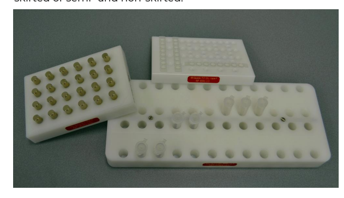
Fig 4: POM versions of the manual separators

supernatant removal. The product is suitable for U- and V-bottom shaped 96 well microplates and for most PCR plates, skirted or semi- and non-skirted.